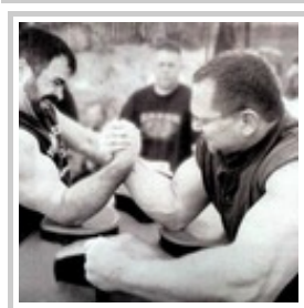
Stuff You Should Know About Arm Wrestling