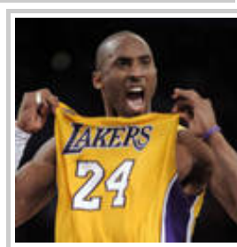
Top 10 NBA Players Who Never Played College Hoo...