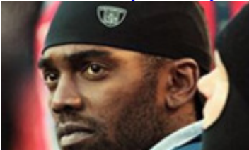
Randy Moss decides to retire