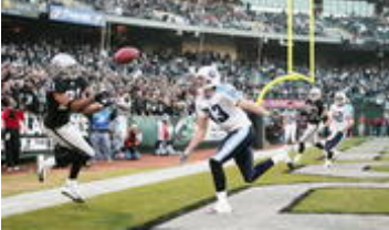
Dallas Cowboys' Safety Search Narrowed