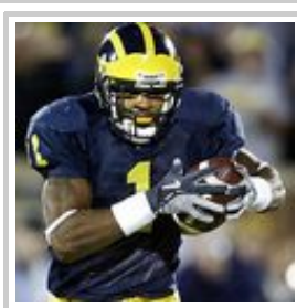
College Football's Top 20 Helmets