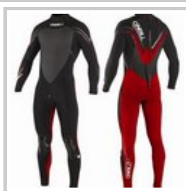
Video Of The Making Of Flotation Wetsuit