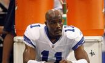
Can Jay Cutler and Roy Williams Co-Exist?