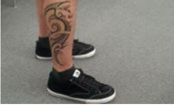
Rex Ryan shows up to camp with new tattoo