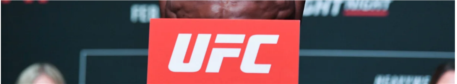
PHOENIX, ARIZONA – FEBRUARY 16: Aljamain Sterling poses on the scale during the UFC Fight Night weigh-in at Comerica Theatre on February 16, 2019 in the Phoenix, Arizona.

Sterling is expected to be out for the rest of the year, as the rehabilitation process will take time. Meanwhile, the UFC could make an interim title fight involving top contenders like Yan, Sandhagen, or Rob Font. What do you think about UFC's plan going further? Will the challengers bide their time, or will they be as active as 'Funk Master' was before he became champion?