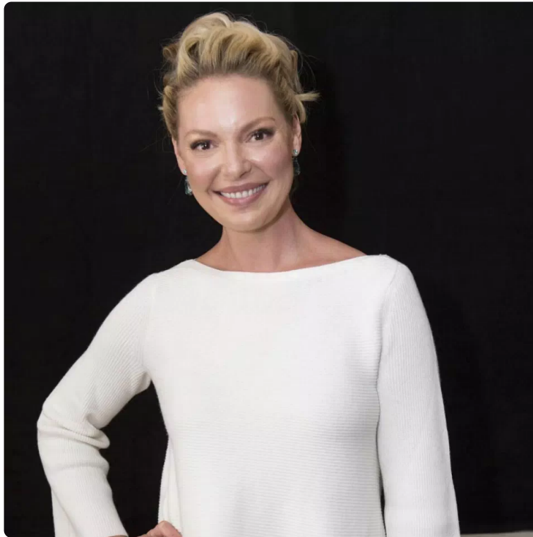
Katherine Heigl Undergoes Surgery to Relieve "Most Excruciating Pain" in Her Neck